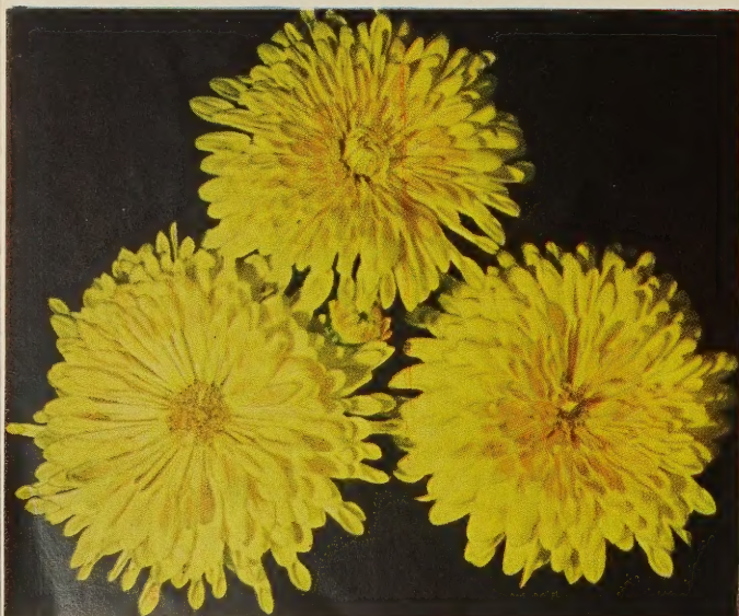
SULPHUR SPOON. 60c each; 3 for $1.50